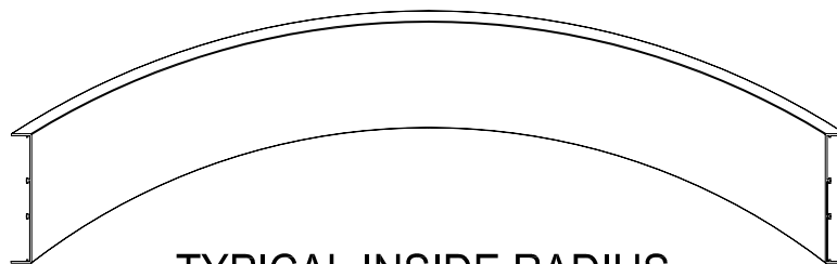
TYPICAL INSIDE RADIUS