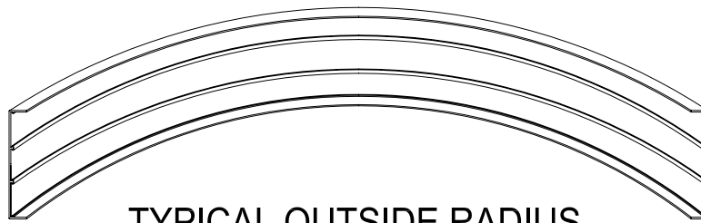
TYPICAL OUTSIDE RADIUS